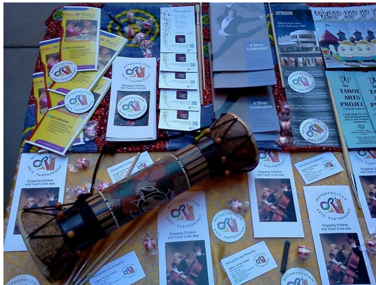
2012 MAP Booth At Agency Fair